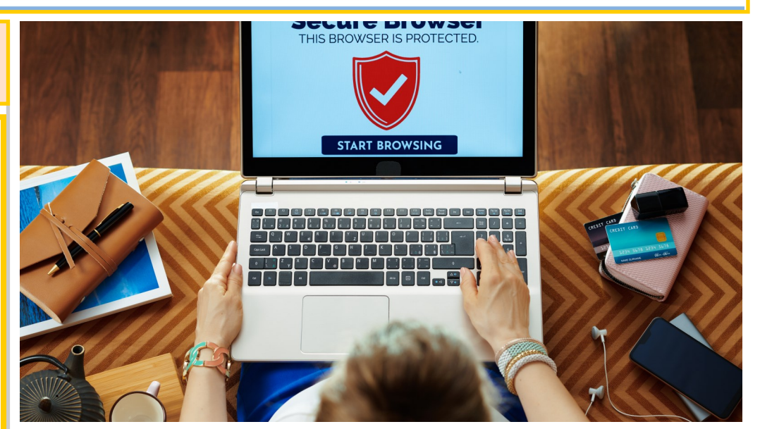
Breaking Bad Habits 4 Ways Your Employees Are Putting Your Business At Risk Of Cyber-Attack

Our Mission: "Through our core values and technology, continually protect and enrich every organization we've been given the privilege to serve."