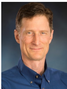
This monthly publication provided courtesy of Todd Clark President of DenaliTEK Inc.